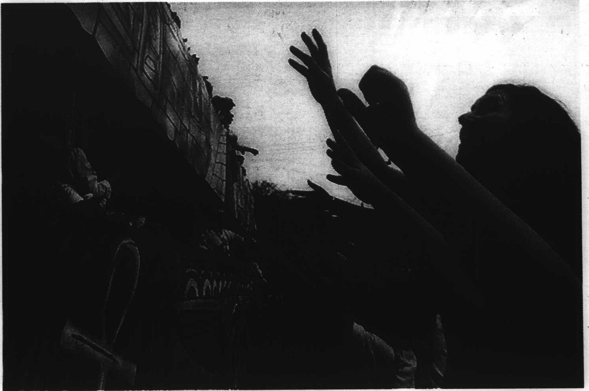
Floats in the St. Patrick's Day Parade towered almost 30 feet in the air and had more than 20 people throwing beads, cabbages and other vegetables from them.