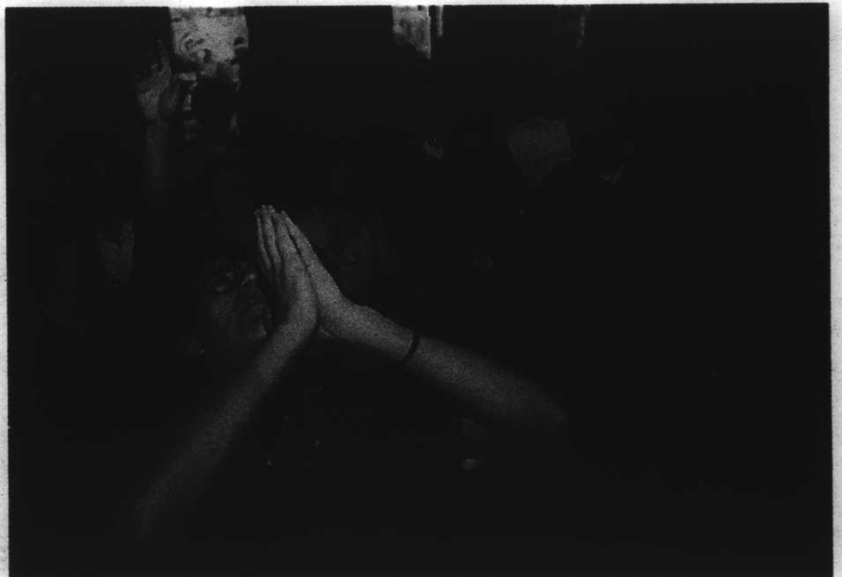
As is tradition in the quarter, a man drops his conveniently cropped pants as a plea for beads. The woman above him laughed and did not throw him his reward.