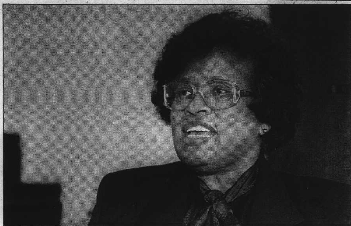
Joycelyn Elders, former U.S. surgeon general, speaks during a luncheon at Nebraska Wesleyan University on Friday.