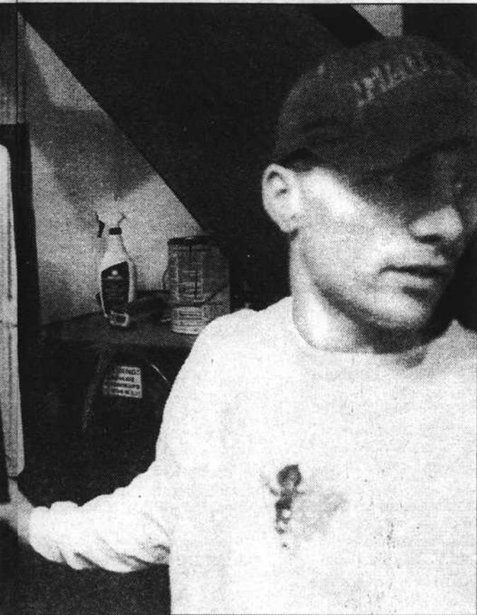
design from more than 1,000 options.