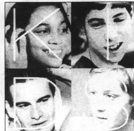
Various Artists "Kids — Original Motion Picture Soundtrack" Grade: C+ NY LLC

Forget the hype surrounding "Natural One," the best stuff on this soundtrack is not Folk Implosion.