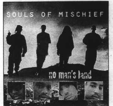
Souls of Mischief "No Man's Land" Jive Grade: B

Once heralded as the X-men of hip hop for their versatility and strength, Souls of Mischief return with a sophomore effort that may leave Professor X scratching his head.