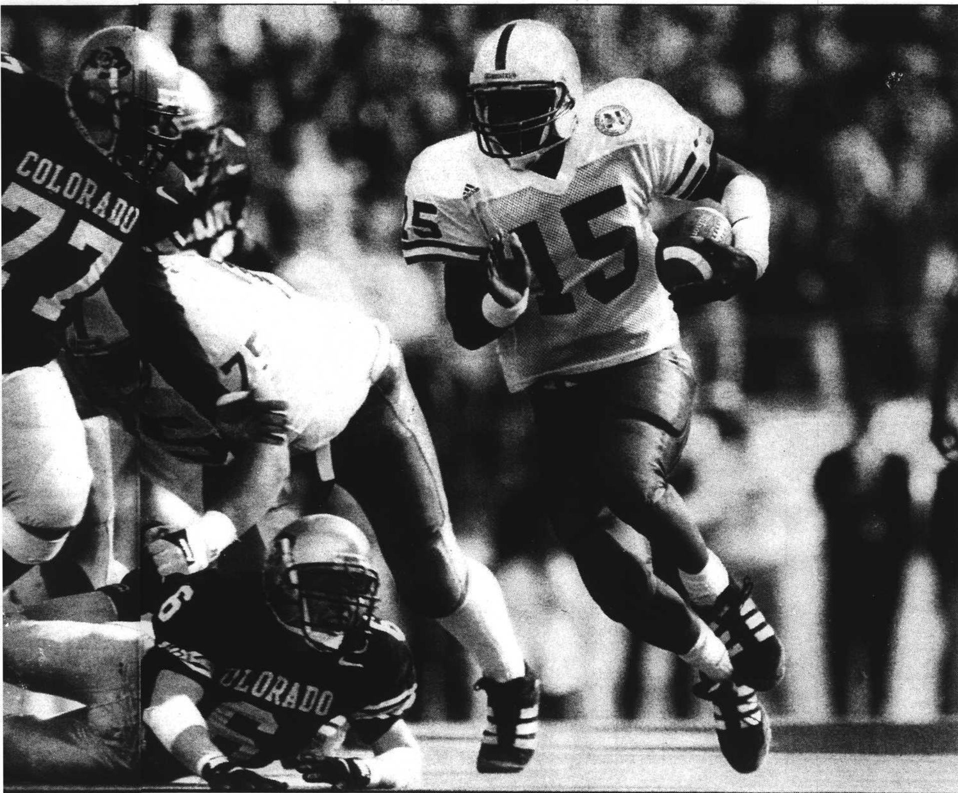
Quarterback Tommie Frazier runs through the Colorado defense as the Buffaloes' Viliami Maumau eyes him. Colorado strong safety Ryan Black is being blocked by Nebraska's Chris Dishman. Frazier had 281 yards of total offense Saturday.