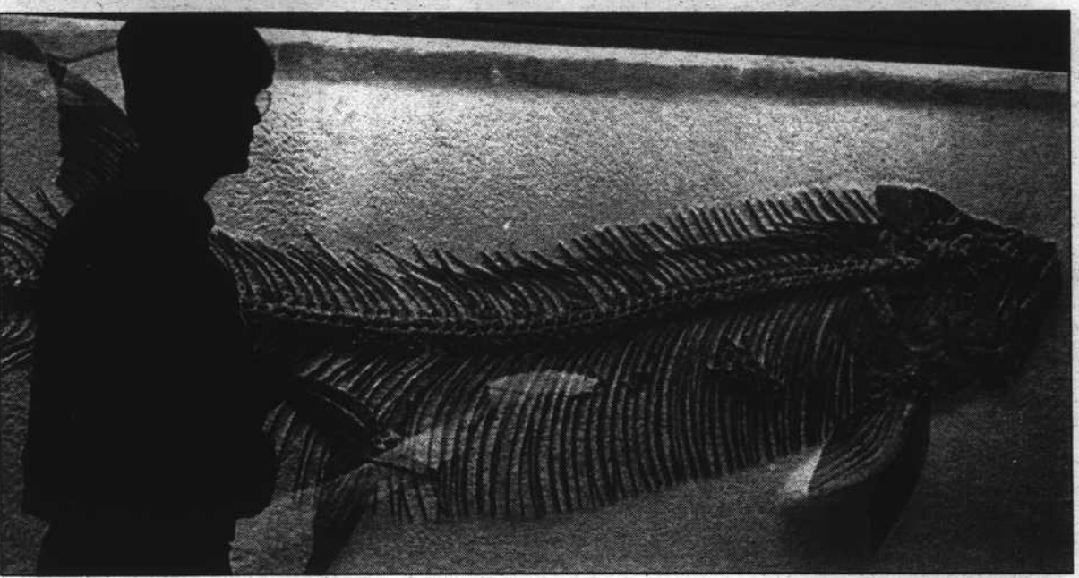
The skeletal remains of a bulldog tarpon, Xiphactenus, are on display at the Mesozoic Gallery in Morrill Hall. The gallery is scheduled to open Oct. 1.