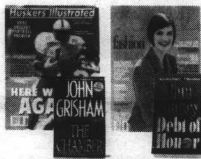
GENERAL BOOKS Best Sellers, classics and magazines