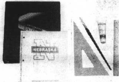
SCHOOL SUPPLIES Notebooks, pens and art supplies