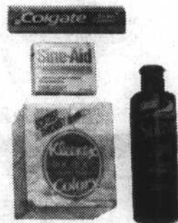
HEALTH & BEAUTY AIDS Shampoo, toothpaste and cosmetics