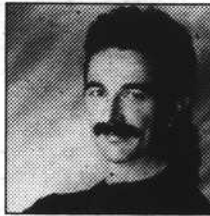
Aaron Tippin September 3