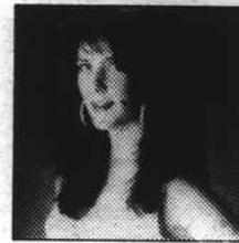
Kathy Mattea August 31