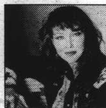
Pam Tillis September 2