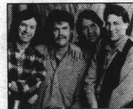
Nitty Gritty Dirt Band September 4