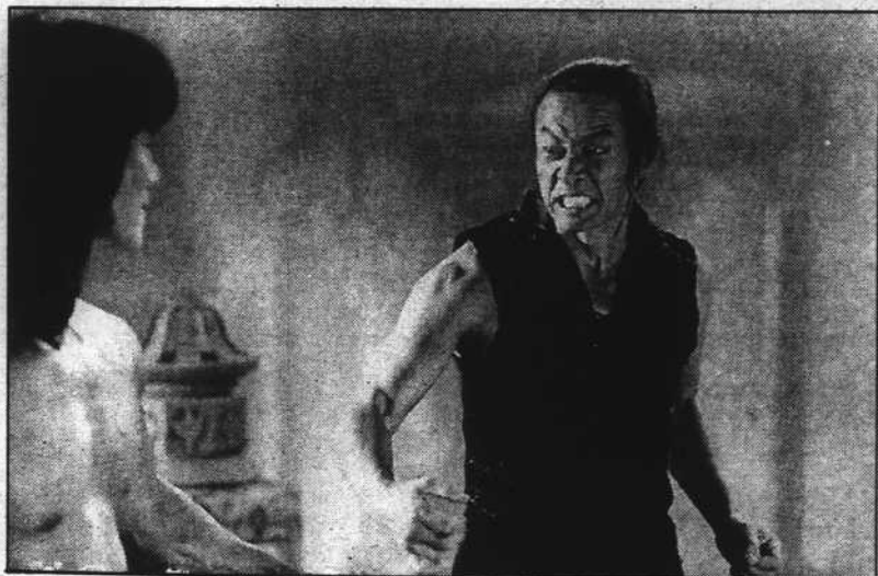
Liu Kang (Robin Shou, left) battles the demon sorcerer Shang Tsung (Cary-Hiroyuki Tagawa) in "Mortal Kombat."