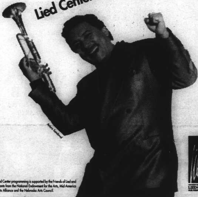
Lied Center programming is supported by the Friends of Lied and grants from the National Endowment for the Arts, Mid-America Arts Alliance and the Nebraska Arts Council.