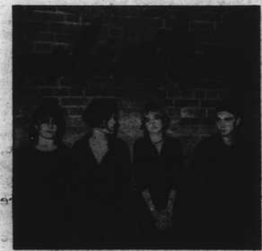
Elastica "Elastica" Geffen Records Grade: A

Elastica is a band that shares the Beatles' talent for writing poppy, witty songs. Replacing the Lennon/McCartney team are two female singers who can both harmonize sweetly and belt out rockers.