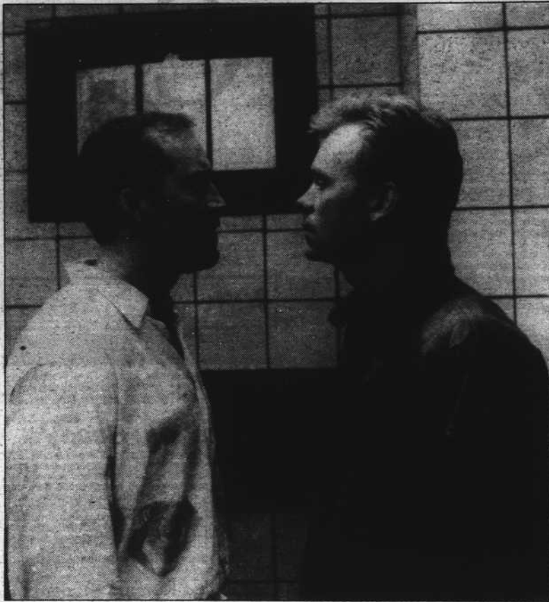
Nicolas Cage and David Caruso star in "Kiss of Death," which opens today.