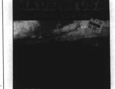
Sonic Youth "Made in USA" Rhino Records Grade: B-

Motion picture soundtracks are hot. From the retro-rock of "Forrest Gump" to the soul/surf hybrid of "Pulp Fiction," it was inevitable that lost soundtracks from the past would eventually start springing up. Enter "Made in USA."