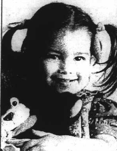
There are no small victories in the fight against heart disease.

The movie will be shown Sunday at the Mary Riepma Ross Film Theater in the Sheldon Memorial Art Gallery as part of the University Program Council International Film Series.