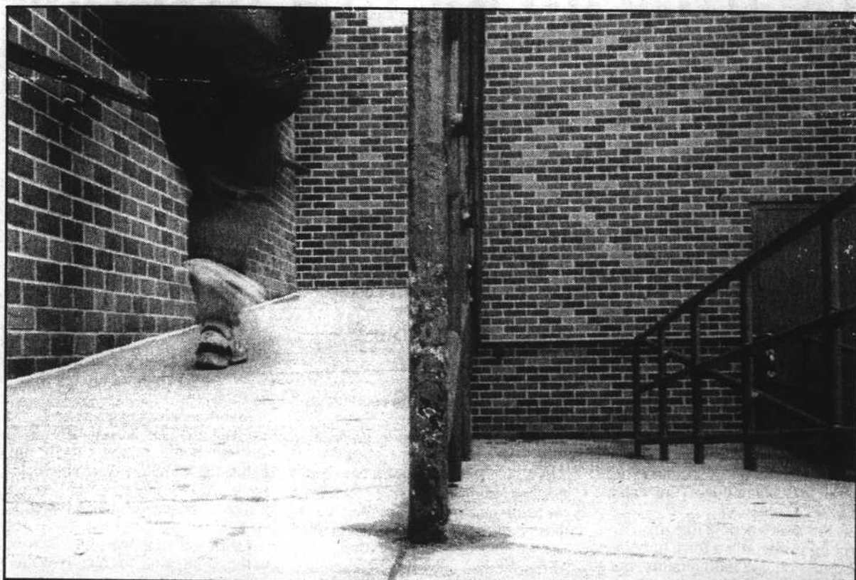
Plans are in the works to improve access to the handicapped in the Nebraska Union. Some improvements would occur regardless of the results of Wednesday's referendum before students.