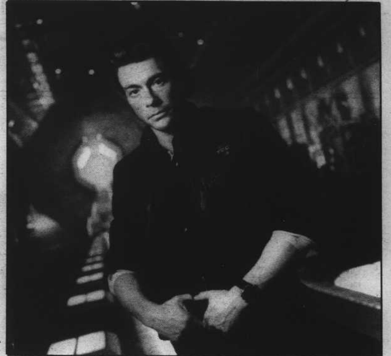
Jean-Claude Van Damme stars in "Timecop."

Jean-Claude Van Damme plays a lonely law enforcement official who works in the time enforcement de-