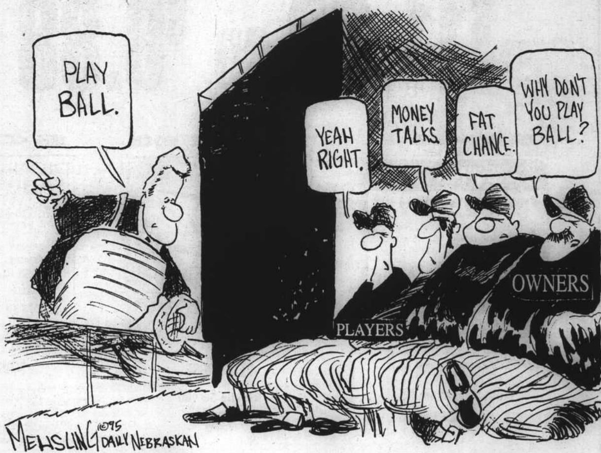
Mehling ©95 DAILY NEBRASKAN

The Daily Nebraskan welcomes brief letters to the editor from all readers and interested others. Letters will be selected for publication on the basis of clarity, originality, timeliness and space available. The Daily Nebraskan retains the right to edit or reject all material submitted. Readers also are welcome to submit material as guest opinions. The editor decides whether material should run as a guest opinion. Letters and guest opinions sent to the newspaper become the property of the Daily Nebraskan and cannot be returned. Anonymous submissions will not be published. Requests to withhold names will not be granted. Submit material to the Daily Nebraskan, 34 Nebraska Union, 1400 R St., Lincoln, Neb. 68588-0448.