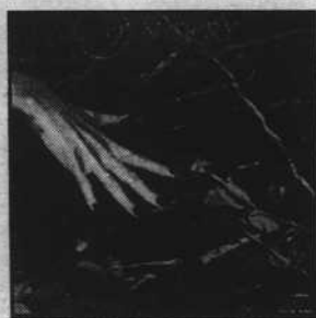
Ministry With Sympathy