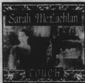
Sarah McLachlan Touch