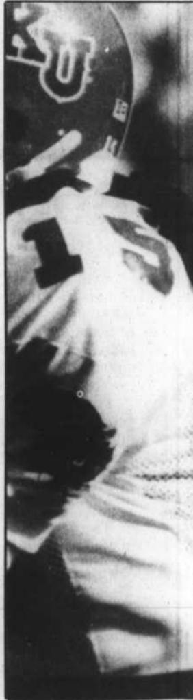
Nebraska linebacker game at Nebraska.