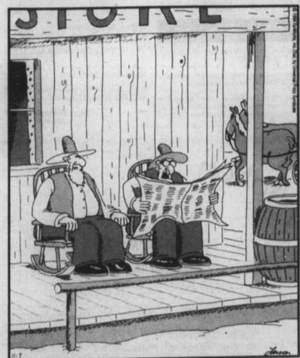
"Whoa! Here we go again! ... 'Pony Express Rider Walks into Workplace, Starts Shooting Every Horse in Sight.'"