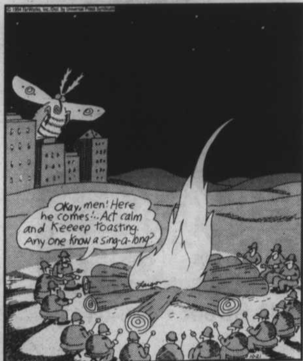
The Army's last-ditch effort to destroy Mothra.