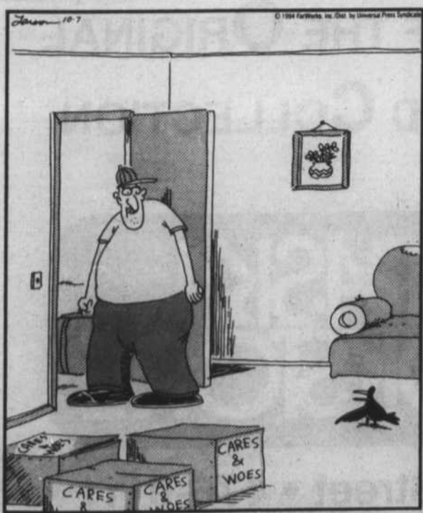
"Hey hey hey! ... Before you go, pack up this depressing garbage of yours and get it out of here!"