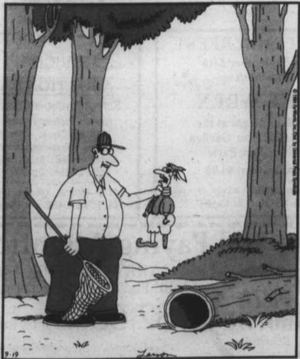
"Well, lad, you caught me fair and square. ... But truthfully, as far as leprechauns go, I've never been considered all that lucky."