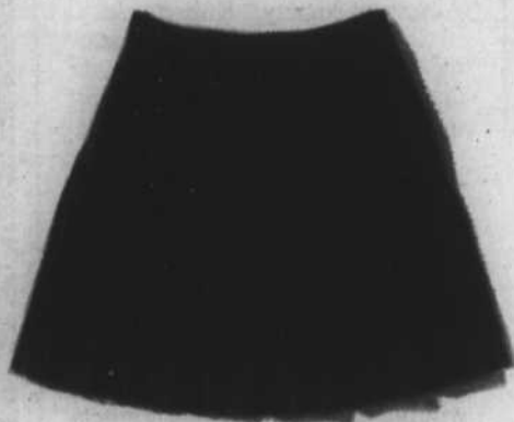
TARTAN SKIRT 17 99

This fall a few pieces are all you need to give your WARDROBE a kick. And what are big looks this season? School-girl style tartan , classic cotton and lots of denim . At Target fundamentals don't have to cost a fortune.