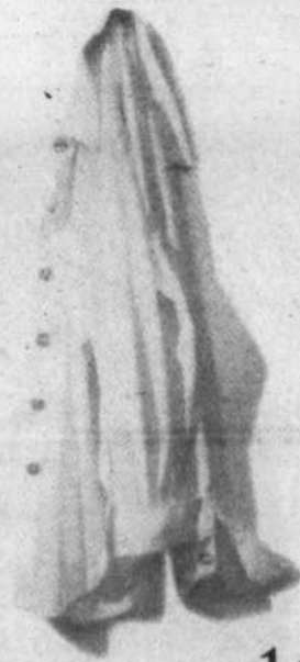
WHITE COTTON SHIRT 14 99