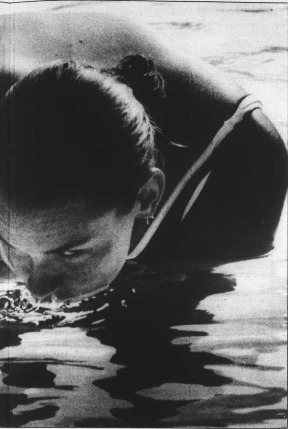
bubbles during swimming lessons. Each guard is required to teach both