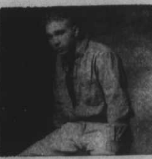
For an appointment, call 476-PLAN

Make the smart choice. Come to Planned Parenthood.