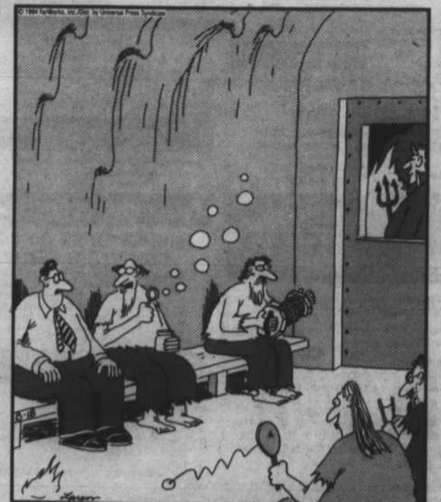
"Oh, they'll find something for you real soon. ... Me? I'm forever blowing bubbles."