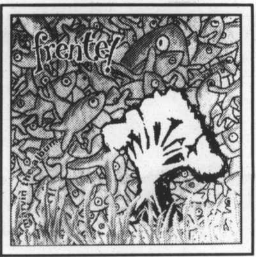
Frente! "Marvin the Album" *CD's $8.97/CS's $5.97