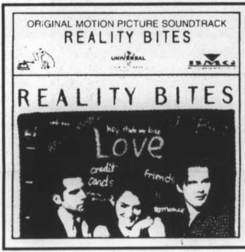
Reality Bites Soundtrack CD's $11.97/CS's $7.97