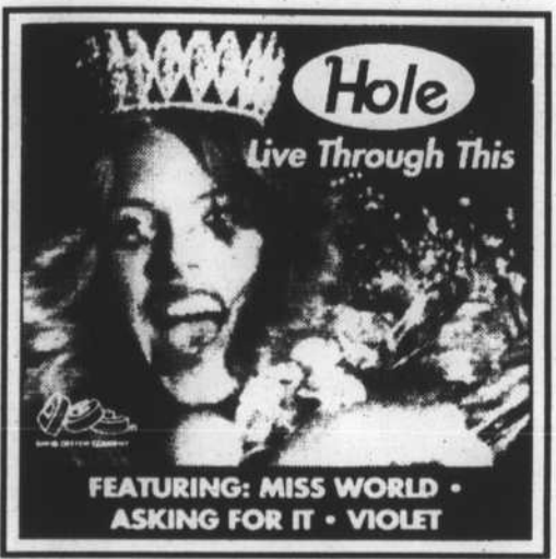
Hole "Live Through This" CD's $10.97/CS's $6.97