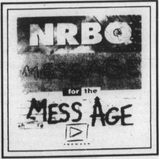
NRBQ "Message" CD's $10.97/CS's $7.97