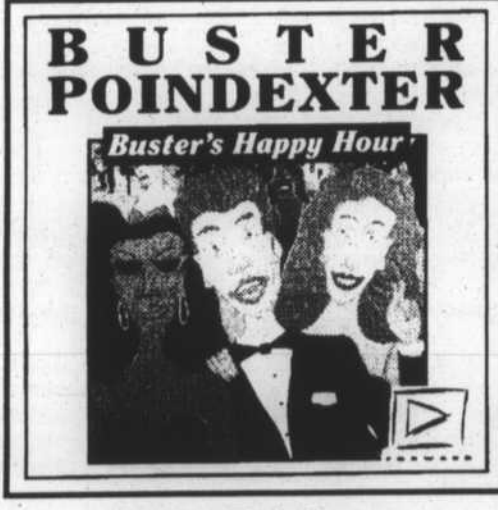
Buster Poindexter "Buster's Happy Hour" CD's $10.97/CS's $7.97