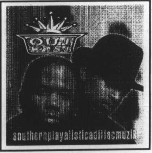
Outkast "southernplayalistic . . ." CD's $10.97/CS's $6.97