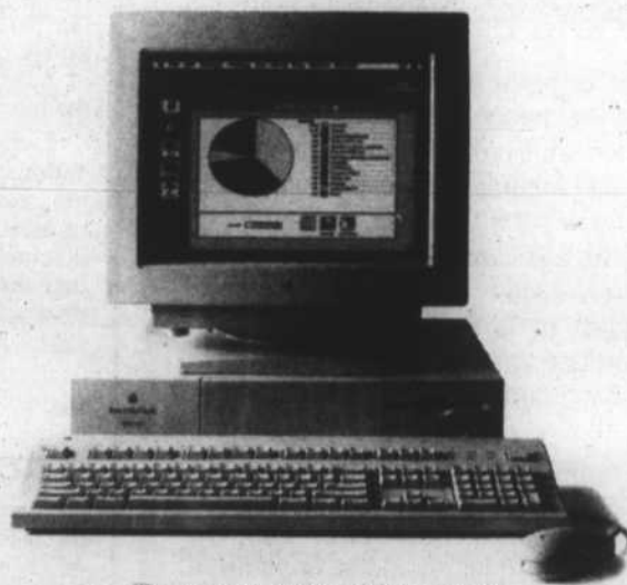
Power Macintosh 6100/60 8/160 with an Apple Color Plus 14" Display, an Apple Extended Keyboard II and mouse.

Right now, when you qualify for the Apple Computer Loan, you could pay as little as $33* a month for a Power Macintosh. It's one of the fastest, most powerful personal computers ever. Which means you'll have the ability to run high-performance programs like statistical analysis, simulations, video editing and much more. Without wasting time. If you'd like further information on Power Macintosh, visit your Apple Campus Reseller. You're sure to find a dream machine that's well within your budget.