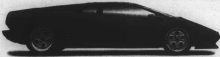
Lamborghini Diablo VT with leather interior, cool wheels and a really, really, really fast engine.

One of these high-speed, high-performance machines can be yours for low monthly payments. The other one is just here for looks.