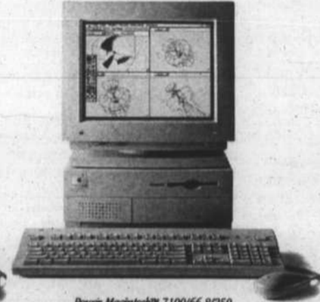
Power Macintosh™ 7100/66 8/250, Macintosh® Color Display, Apple® Extended Keyboard II and mouse. Only $3,102.00.

Right now, you could take home one of the country's best-selling personal notebook computers for incredibly low monthly payments. By choosing from the entire Macintosh® line or grab a PowerBook®, the most popular notebook computer. They're all powerful, easy to use and more affordable than ever. It's that simple. So, stop by your Apple Campus Reseller for further information. You'll be amazed what you can buy on a tight college budget.