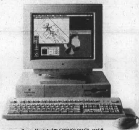
Power Macintosh™ 6100/60 8/160, Apple® Color Plus 14" Display, Apple Extended Keyboard II and mouse. Only $2,031.00.