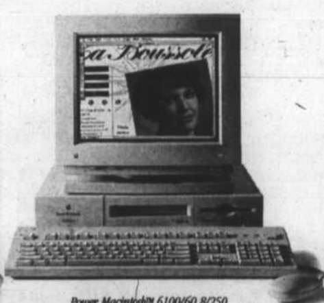
Power Macintosh™ 6100/60 8/250, internal AppleCD™ 300i Plus CD-ROM Drive, Macintosh® Color Display, Apple® Extended Keyboard II and mouse. Only $2,445.00.