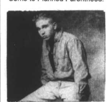
For an appointment, call 476-PLAN

Make the smart choice. Come to Planned Parenthood.