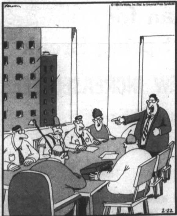
"What? MacDougal is being promoted over me? ... Well, that does it! I won't take no orders from no stinkin' sodbuster!"