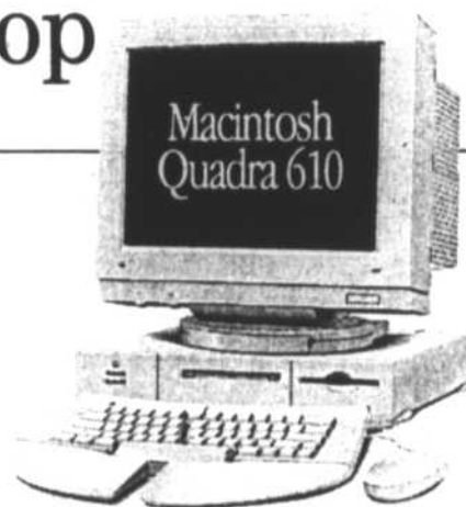
Macintosh Quadra™ 610 computer

Affordable performance, flexibility, and room to grow. Based on the fast, 25-megahertz 68040 processor, the Apple® Macintosh Quadra™ 610 computer provides affordable high performance. It's ideal for users who want high performance and flexibility. The Macintosh Quadra 610 computer is incredibly expandable. It comes with 8 megabytes of RAM, and can be expanded to 68 megabytes.