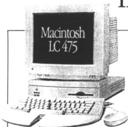
Macintosh LC 475 computer

Power and speed have never been this affordable. If you're looking for the performance advantages associated with the powerful Motorola 68040 processor, the new Apple® Macintosh® LC 475 computer may be just what you need. Running more than twice as fast as the Macintosh LC III, the Macintosh LC 475 puts tremendous power and speed at your fingertips.