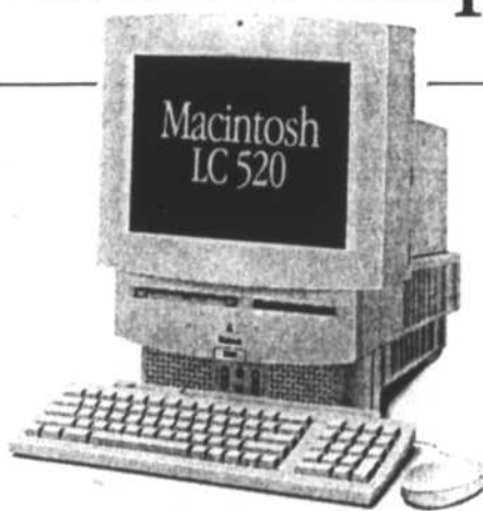
Macintosh LC 520 computer

Power, performance and multimedia capabilities are all built in. The Apple® Macintosh® LC 520 computer has everything you need for running multimedia applications and personal programs—and it's all built in. It combines the simplicity and convenience of an all-in-one design with the versatility of an integrated CD-ROM drive.