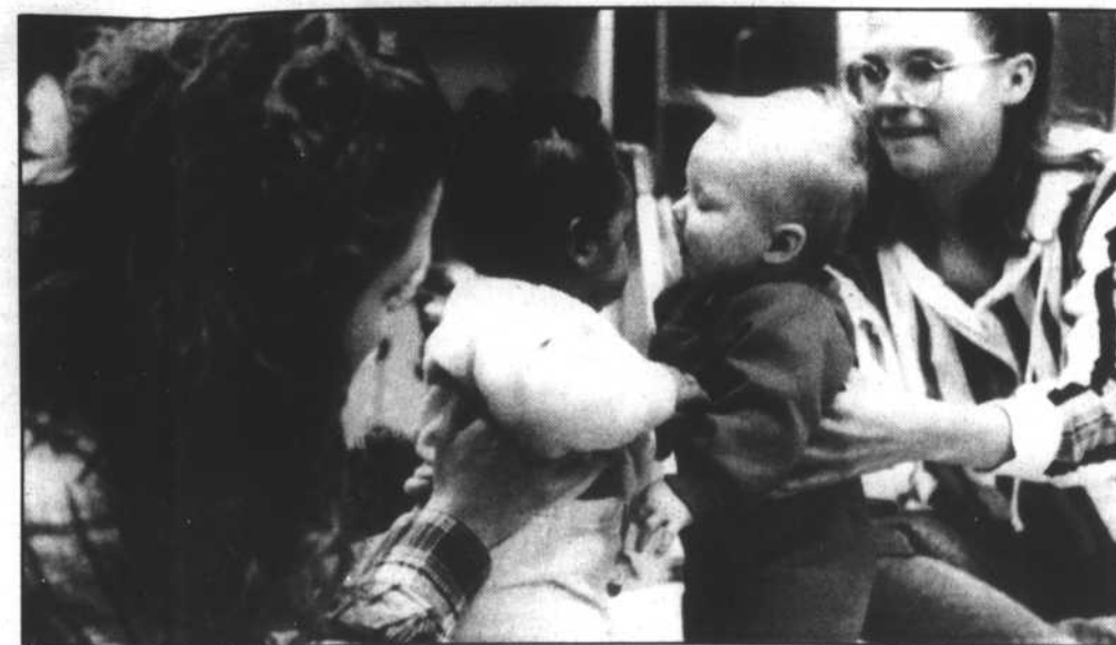
er new two-g said she dy tiny room.