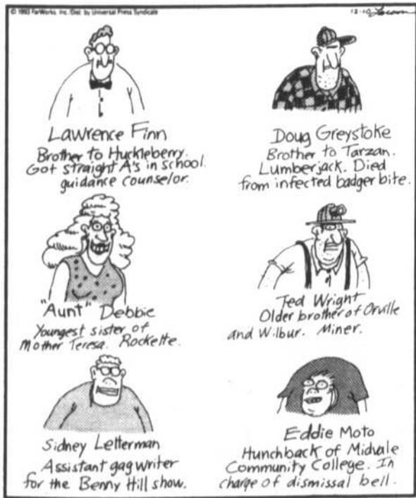
In their sibling's shadow