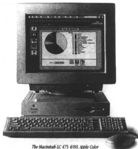
The Macintosh LC 475 4/80, Apple Color Plus 14" Display, Apple Keyboard II and mouse.

Introducing the new Apple Computer Loan. Right now, with this special financing program from Apple, you can buy select Macintosh* and PowerBook* computers for about $30* a month. Or about a dollar a day. (You could qualify with just a phone call.) And if you apply by