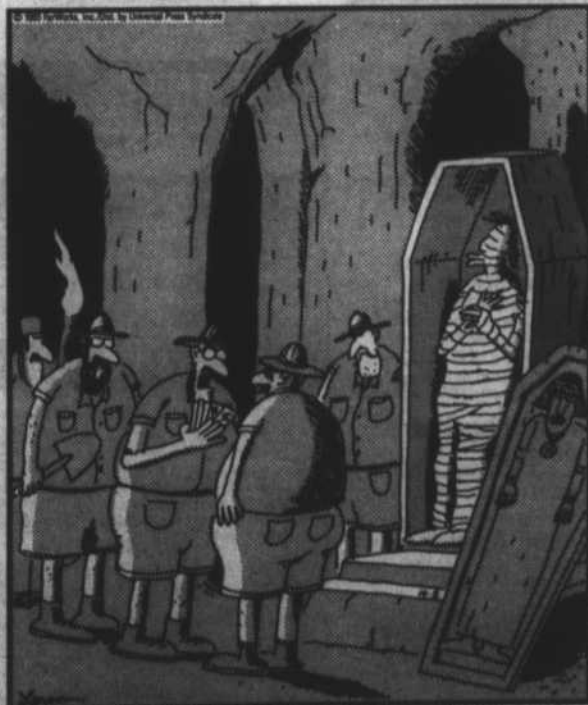
"OK, Professor Big Mouth, we've all chipped in. Here's the hundred bucks, but remember — you gotta kiss her on the lips!"