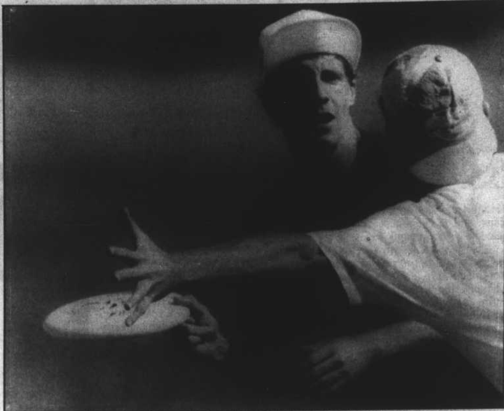
Clockwise from top: