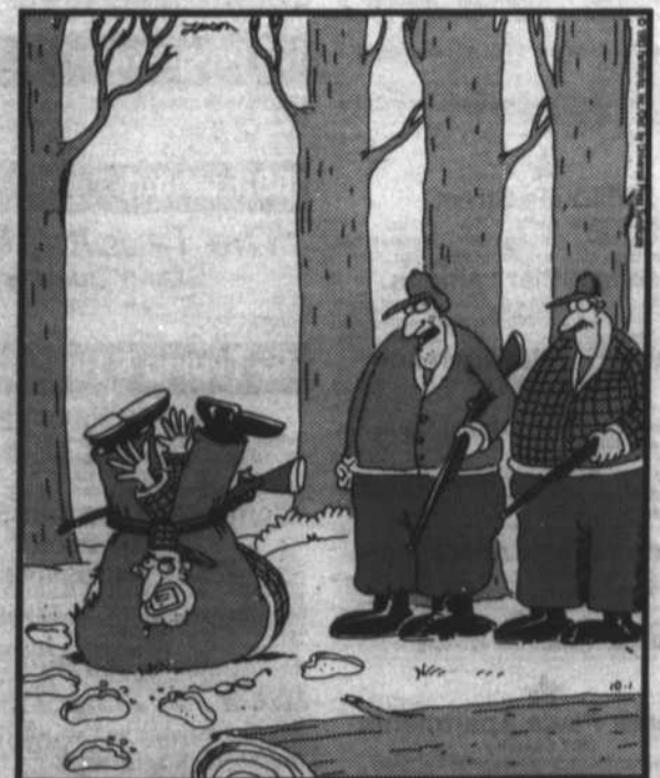
"It's Jim Wilkins, Dave. Same as the others. Trussed up like a Christmas present with his hunting license stuffed in his mouth. ... I want this bear, Dave. I want him bad."