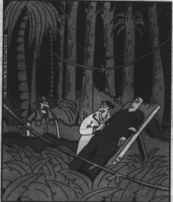
"Excuse me, but may I assume you're not Dr. Livingstone?"