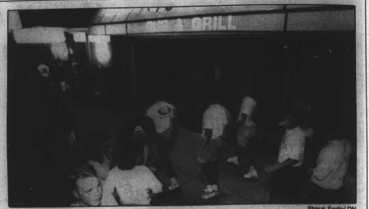
Shaun Sartin/ DN