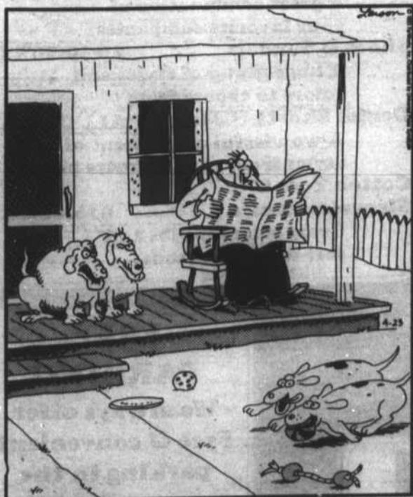
"Man, these pups today with all their fancy balls and whatnot. ... Why, back in our day, we had to play with a plain old cat's head."