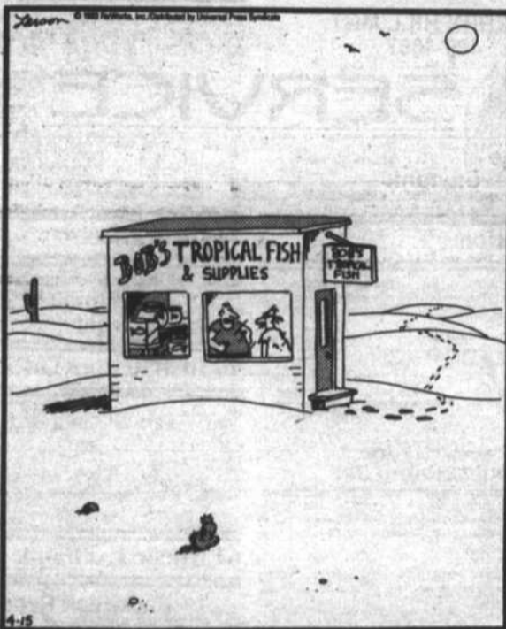
"Hey! You're not lookin' to buy anything, are you? I think you best just keep movin', buddy."