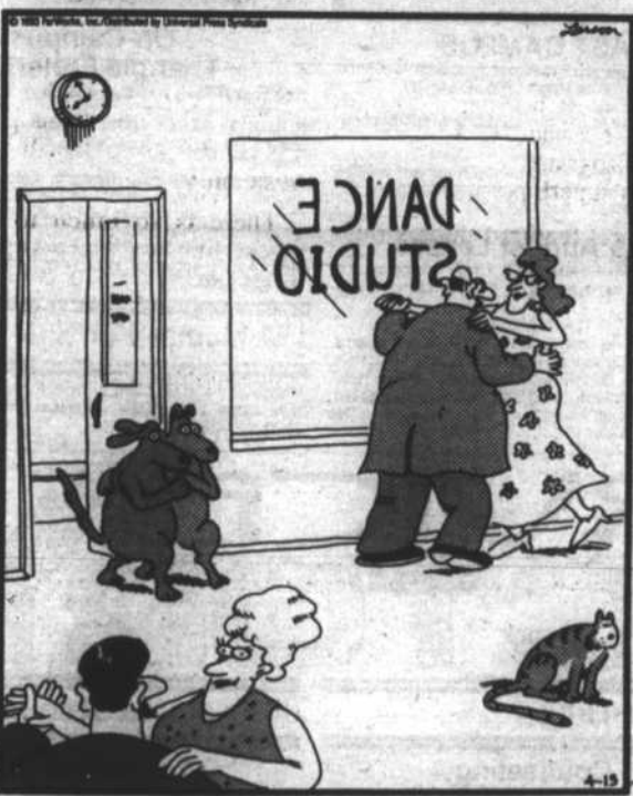
As witnesses later recalled, two small dogs just waited into the place, grabbed the cat, and waltzed out.