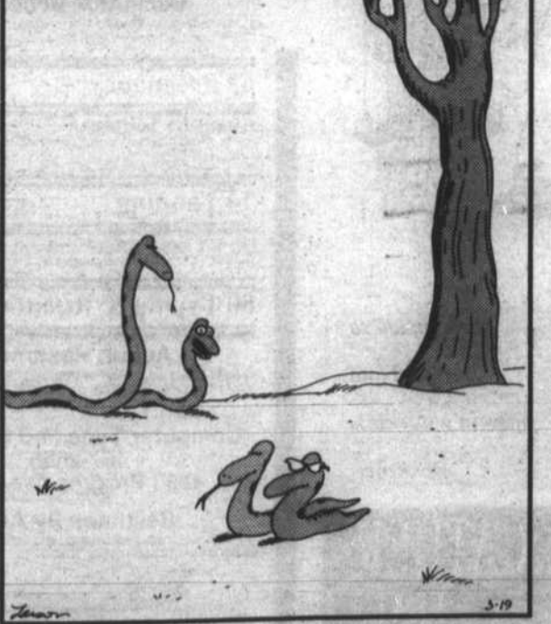
"Look, Dad! ... Snidgets!"