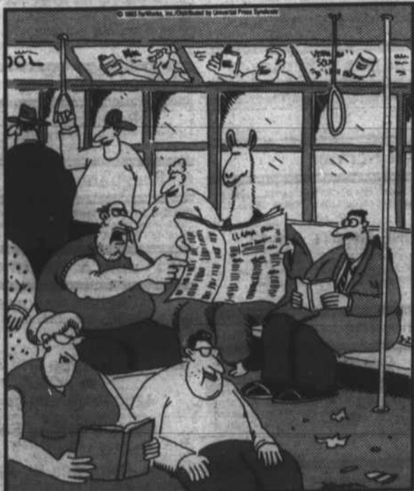
"Hey! You! ... Yeah, you! I ain't gonna tell you again to quit apittin' on me!"