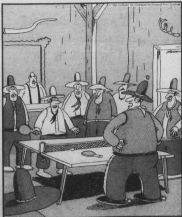
"Well, kid, ya beat me — and now every punk packin' a paddle and tryin' to make a name for himself will come lookin' for you! ... Welcome to hell, kid."