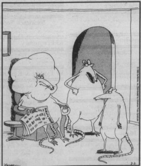
"Quit school? Quit school? You wanna end up like your father? A career lab rat?"