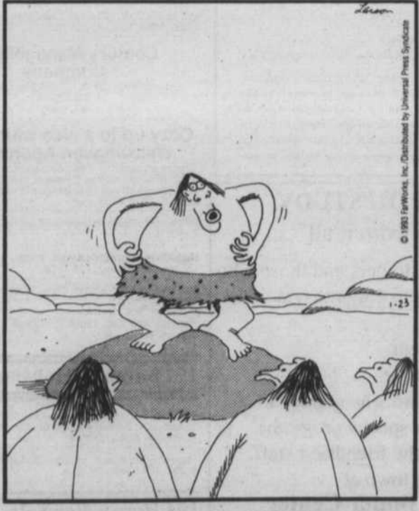
And then, just as he predicted, Thag became the channeler for a 2 million-year-old gibbon named Gus.