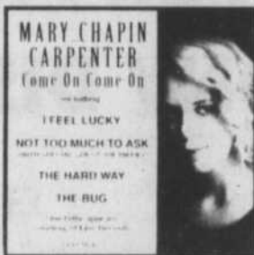
Mary Chapin Carpenter