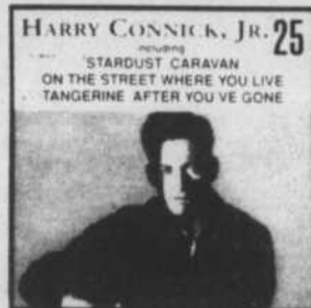
Harry Connick, Jr. CS $6.77/CD $11.77