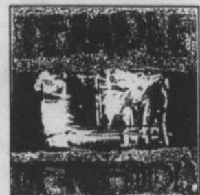
Temple of the Dog