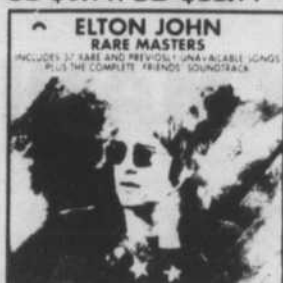
Elton John Cassettes $13.77 CD's $20.77